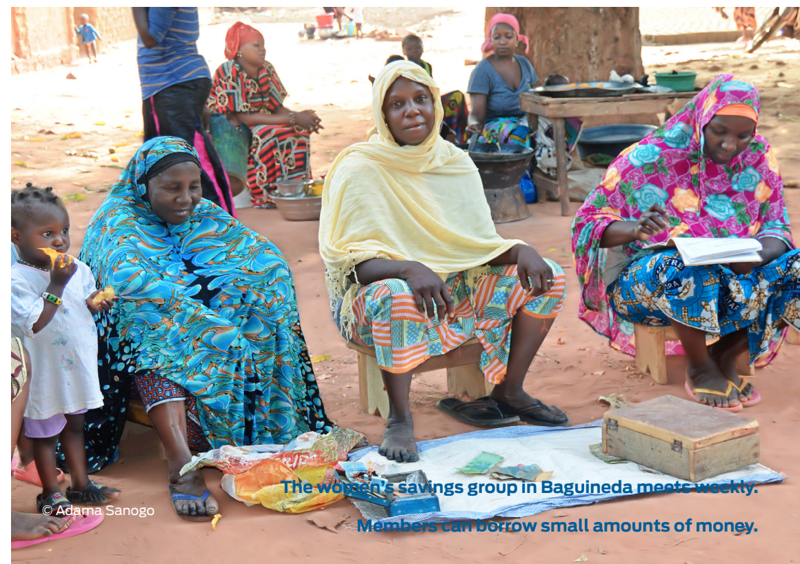
The women's savings group in Baguineda meets weekly.