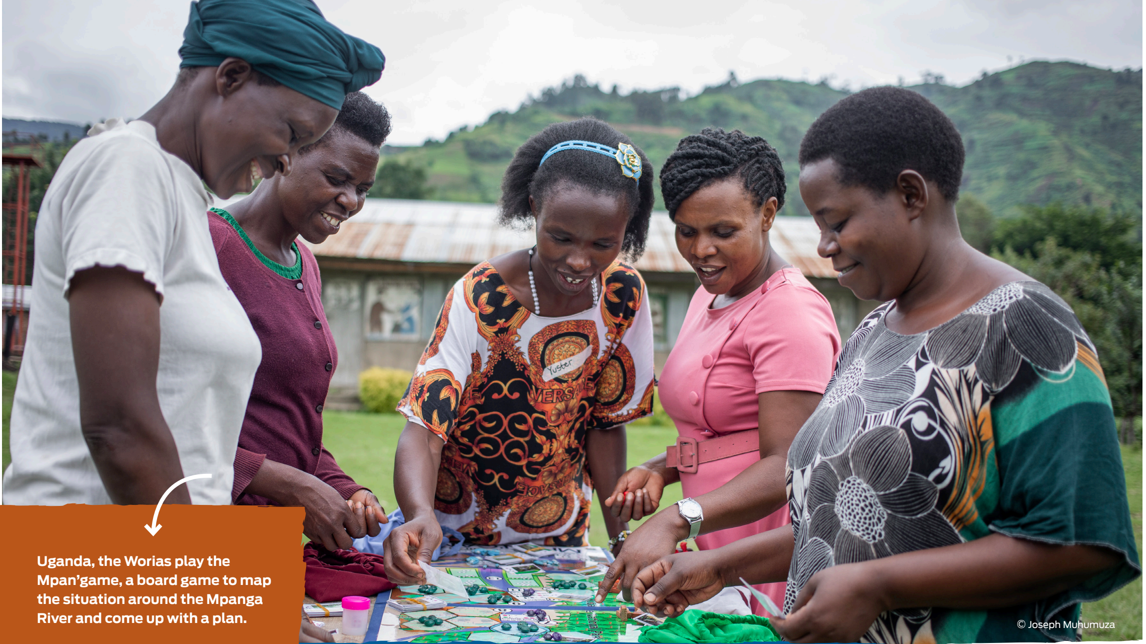
Uganda, the Worias play the Mpan'game, a board game to map the situation around the Mpanga River and come up with a plan.